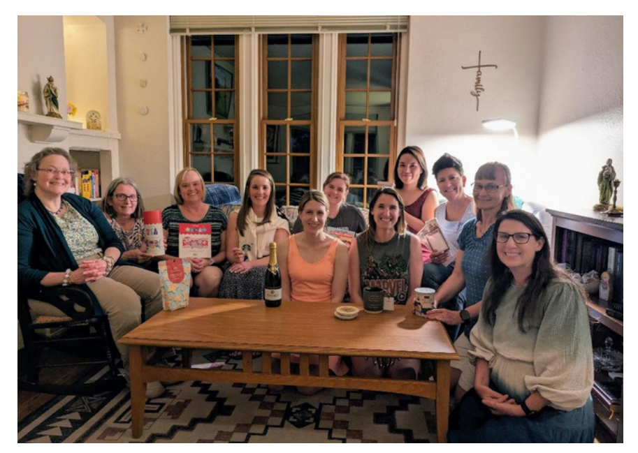
BUNCO had a small group that kept going through the summer