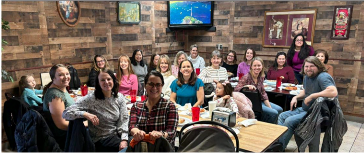
Lunch Bunch celebrated good times and laughs at Asian Sky and Venecia.