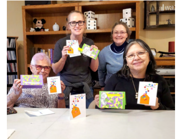
Rubber Stamp Club continued to make beautiful projects!