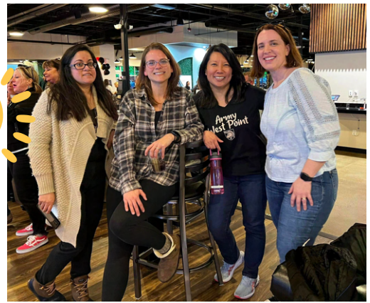
Spouses Night Out crew had a blast at On Par duck pin bowling and creating glass dishes