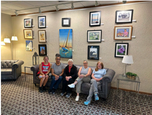
Brush & Palette and Photography Group at last wall hanging!