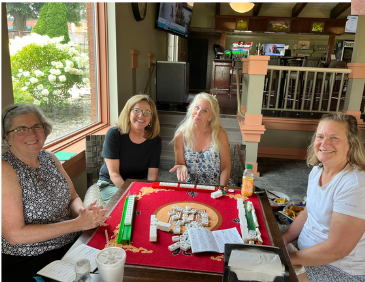
It might be Summer, but nothing can stop the Maj Jongg group! New faces make the game even more fun and veteran players are ready to help everyone learn the ropes!