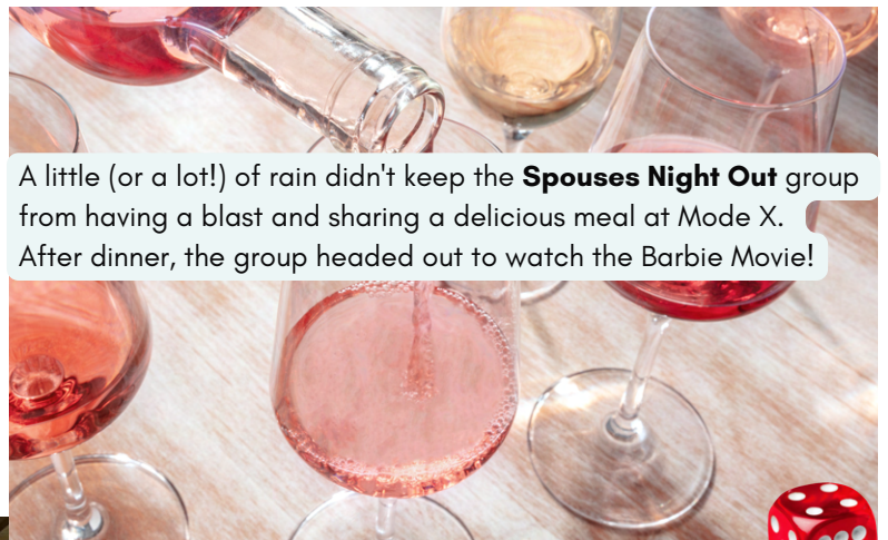
A little (or a lot!) of rain didn't keep the Spouses Night Out group from having a blast and sharing a delicious meal at Mode X. After dinner, the group headed out to watch the Barbie Movie!